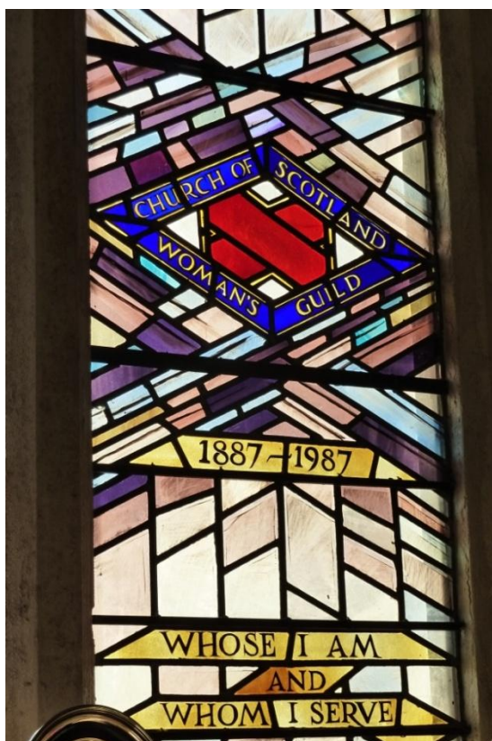
Grahamston United Parish Church window