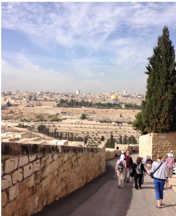
Going down from the Mount of Olives to Gethsemane, Jerusalem

I suspect for many people it was also fitting the names and the places into situation. To visit the Shepherds' Fields outside Bethlehem; to wander through the ruins of Capernaum and Chorazin; to visit the little reconstruction of a first century village in Nazareth; to look down from the ramparts of Masada onto the Judean desert; even to float in/on the Dead Sea.