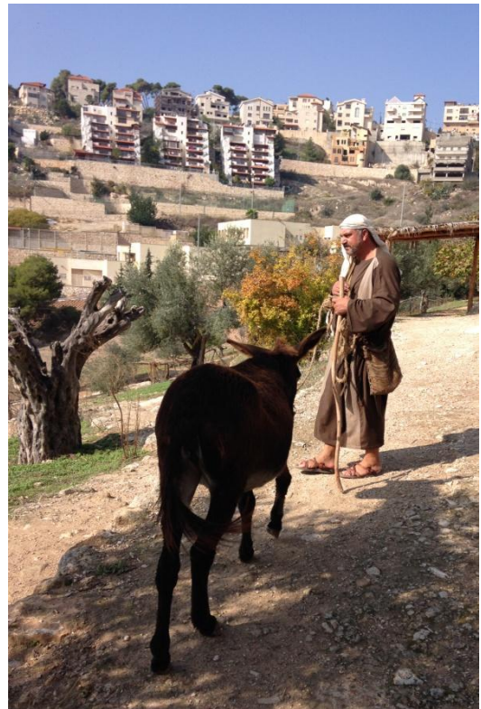
Banana the donkey, Nazareth

In November of last year a group of people from all over Edinburgh, one from Oban, and picking up a couple from Australia, made a pilgrimage to the Holy Land. It was a wonderful trip – the weather was great – and the sites we visited were wonderful. I am having to check myself, again, about not saying, “When we were in the Holy Land...” But the place has that kind of effect on most people. For some it was the slightly edgy atmosphere of Jerusalem, with its layered Biblical and historical sites, with the commanding views from the Mount of Olives, and the sheer size and beauty of the Temple Mount. For others it was the Roman remains at Caesarea Maritima, or the lakeside communion on the shores of Galilee, or the view of Damascus from the Golan Heights. And of course the sunshine and the excellent food helped too, as well as too very good hotels in Jerusalem and Tiberias.