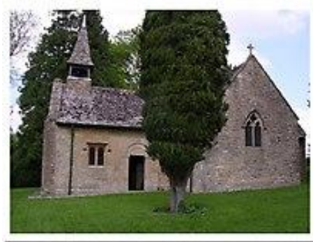
Church at Stowell Park

They who thus reared them Their long rest have won; Ours now this heritage – To guard, preserve, delight in, brood upon; And in these transitory fragments scan The immortal longings in the soul of Man.