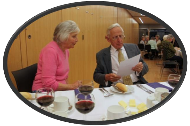
Speaker supper - difficult decisions!