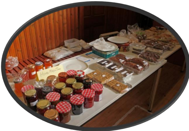
Jam & baking stall 25th September