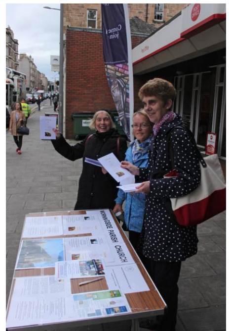
Distributing harvest leaflets 24th September