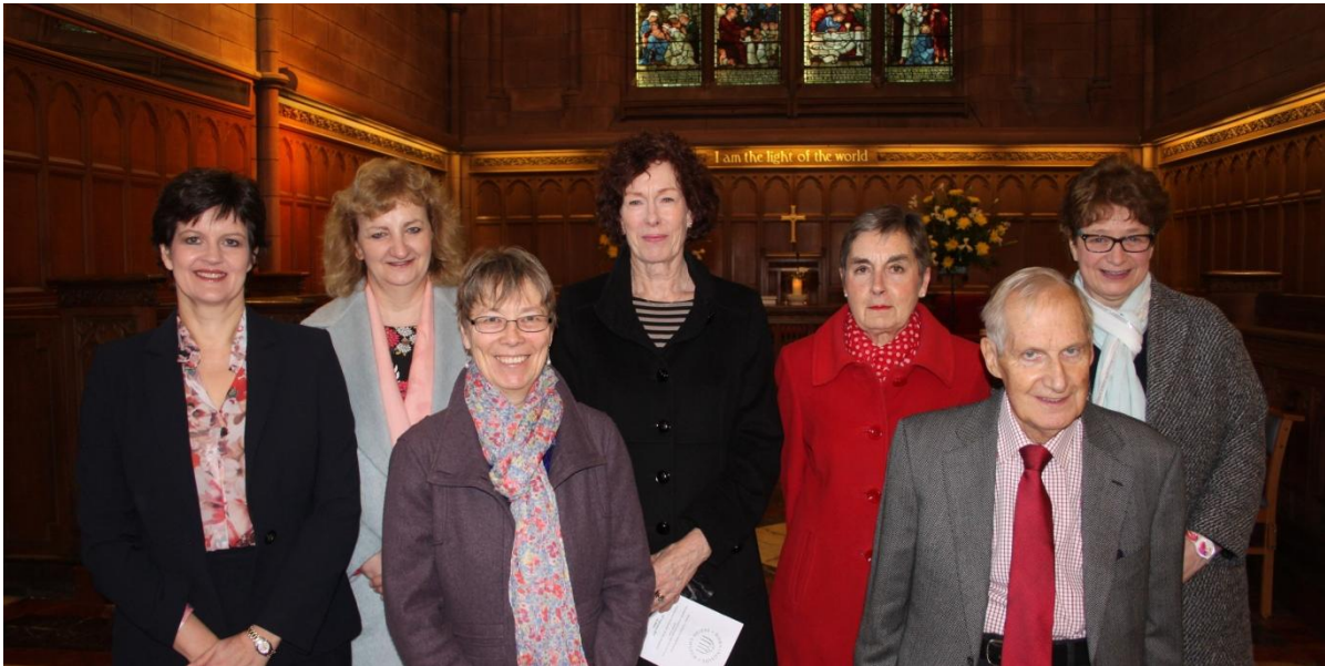
New elders ordained on Sunday 19 th February 2017