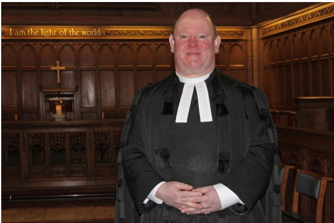
The Minister with the moderatorial robes presented to him during the service on 28 th February.

For those of you already receiving the Church magazine via email, you may already be receiving a weekly email from the Church that highlights some of the current and upcoming events in the Church's week. If you would like to receive this helpful email, please contact the Church Office ( office@morningsideparishchurch.org.uk ) with your email address.