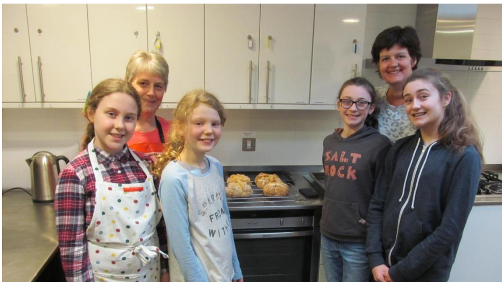
The bread bakers

Date for your diary: Easter Workshop, Wednesday 12 th April 2-4pm in the Braid Hall – simple, fun crafts and activities with an Easter theme for all the family. Mainly aimed at 5-12 year-olds, but all are welcome. If you feel you'd like to help – no special skills needed – whether on the day, or preparing beforehand, please get in touch.