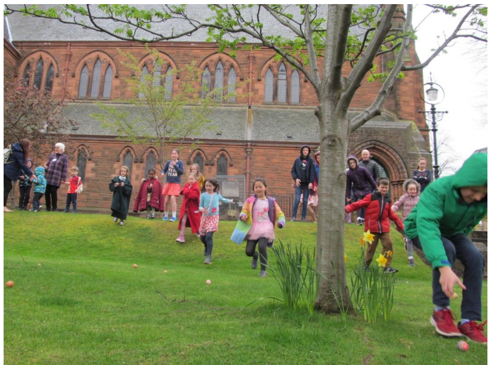
Easter egg rolling

But as I write, it's Easter Day, and the cross outside the church this morning was full of daffodils to remind us of the Resurrection. We've had some fun this week with eggs, bread, paint and a few other things! Our Easter workshop on 12 th April had small numbers, but it didn't matter – everyone seemed to be having a great time, whether making Faberge eggs, stained glass crosses, mini-baskets, painting the mural of the Easter journey to Calvary or enjoying a chat over home-made cake. We also baked