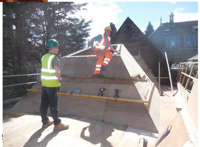
On the roof of the Cluny Hall