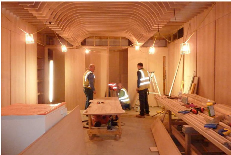
The St Andrew Room taking shape