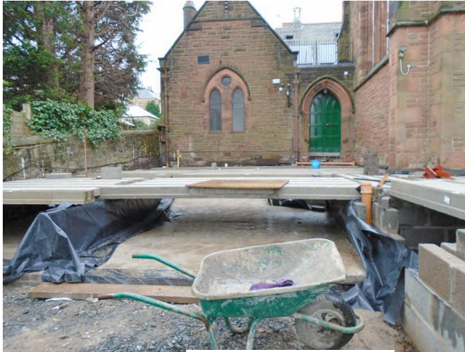
Building the Cluny Hall