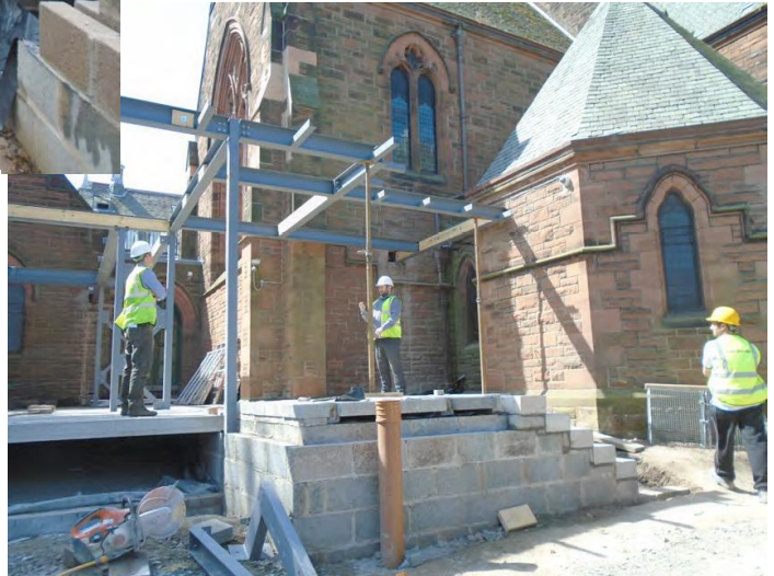
The new building as it develops