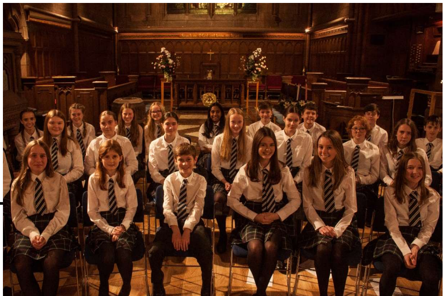
Some of George Heriot's School Chamber Choir after their Morningside Hope concert on 26 November 2022

I hope you'll contact us about becoming one of our fantastic volunteers.